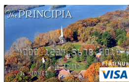
__ Card A